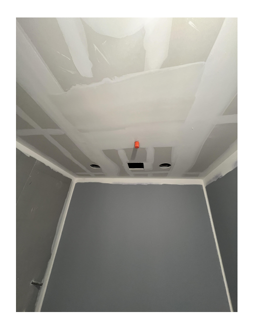
Painting in the restrooms on level 2.