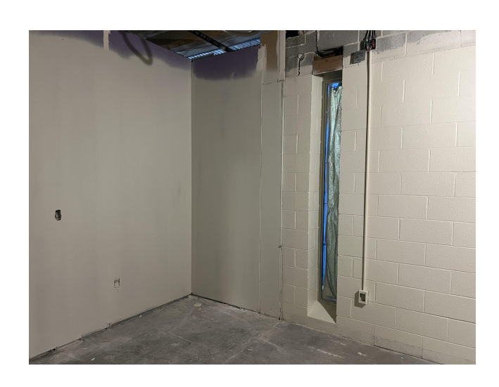
Painting in classrooms on level 2.