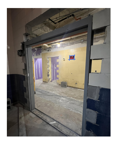
Setting door frames in the stairwell on level 1.